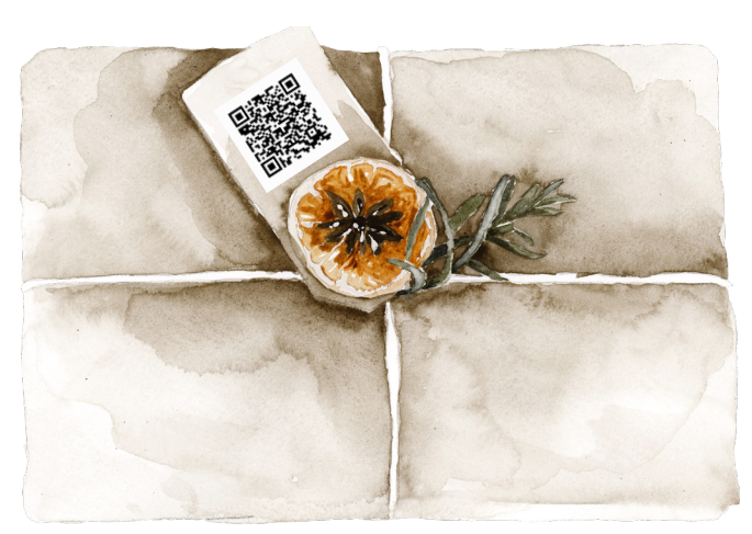
Scan this QR code to connect with us!