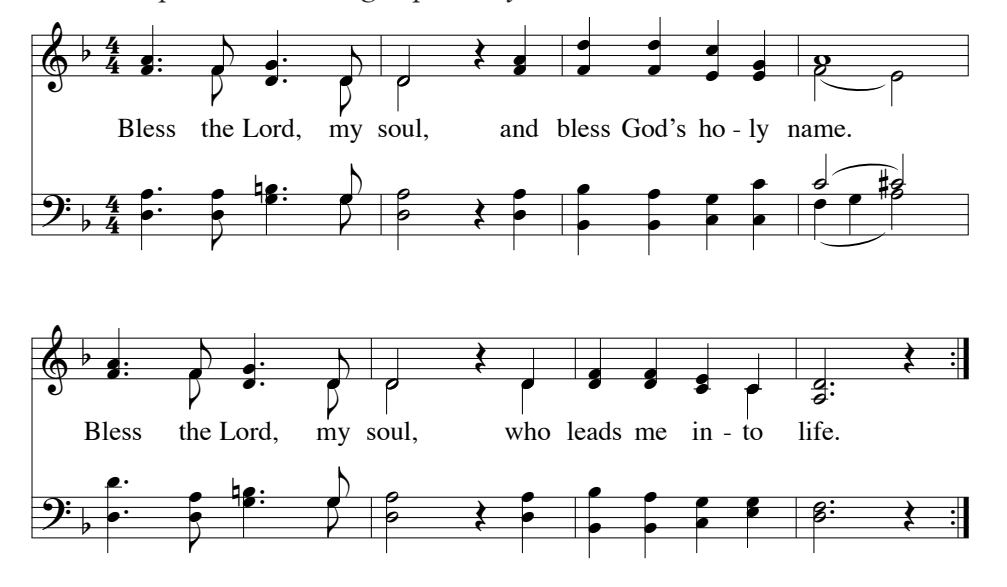
The Psalm The People stand and sing responsively.